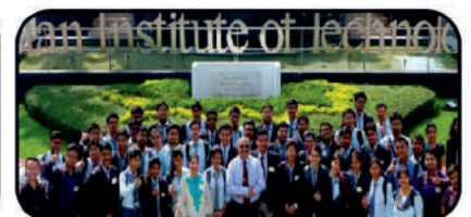
International Internship at AIT, Bangkok