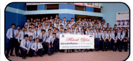
ACCENTURE at NiT