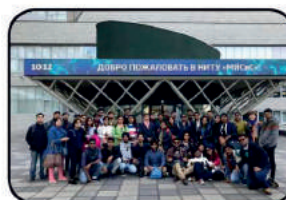
International Workshop Russia